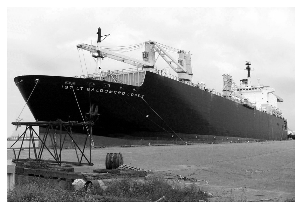
Figure 7-1. USS 1stLt Baldomero Lopez.

of the world. For more information on MPF operations, refer to MCWP 3-32, Maritime Preposi tioning Force Operations . Detailed information on MPF and each MPS prepositioned load can be found on the Blount Island Command's Marine Corps Prepositioning Information Center Web site at https://mcpic.bic.usmc.mil/iMcpic/ default.aspx.