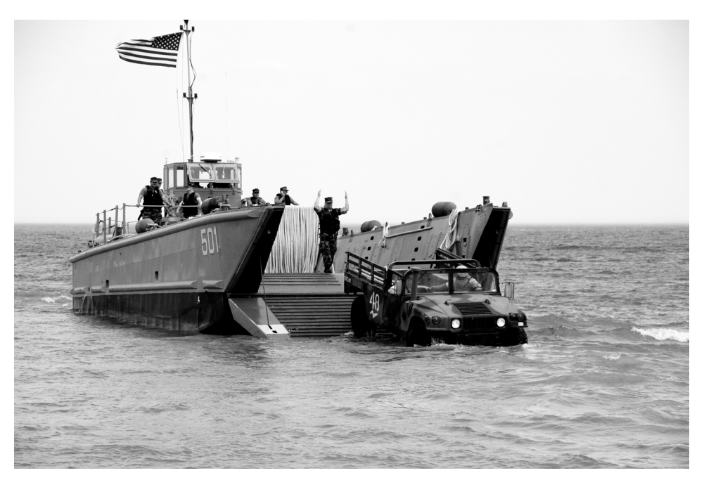
Figure L-10. Landing Craft, Mechanized.

support of MPF operations (see table L-45). With the fielding of the MPF utility boat, one LCM will be retained on each MEU/Alt-MEU MPS.