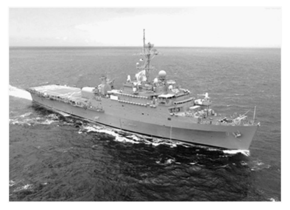
Figure L-4. USS Denver (LPD-9).

The landing craft numbers listed in table L-20 are the maximum number of each type of craft that can be stowed in the well deck exclusive of any other craft.