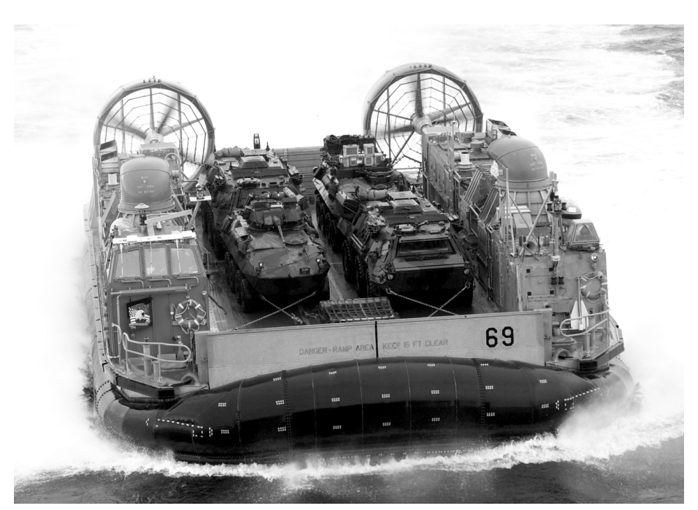
Figure L-8. Landing Craft, Air Cushion.

The LCAC service life extension program provides an additional ten years of amphibious combat vehicle capability with enhanced engines, a new communications suite, buoyancy box refurbishment, and a deep skirt that reduces drag and increases performance. Characteristics of the LCAC are provided in table L-43 on page L-20.