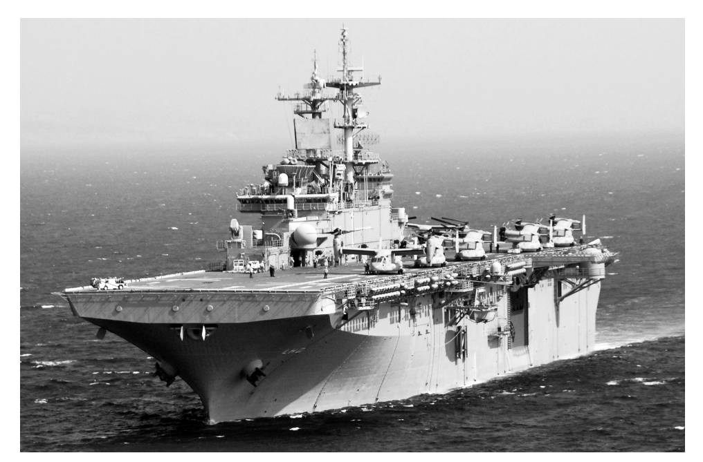
Figure L-3. USS Wasp (LHD-1).

The landing craft numbers listed in table L-14 are the maximum number of each type of craft that can be stowed in the well deck exclusive of any other craft. Combinations of these craft may be stowed in the well deck if necessary.