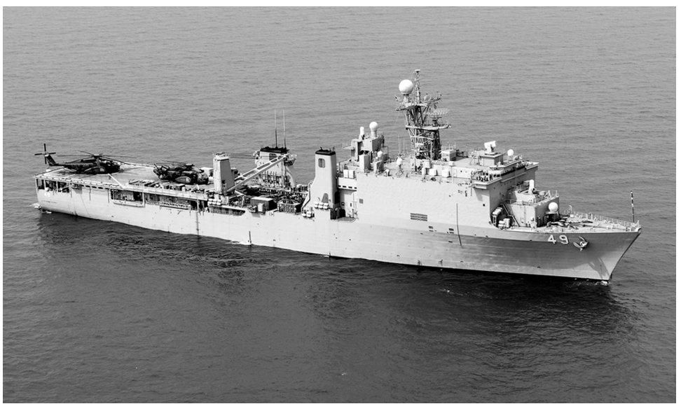
Figure L-7. USS Harpers Ferry (LSD-49).

The landing craft numbers listed below are the maximum number of each type of craft that can be stowed in the well deck exclusive of any other craft.