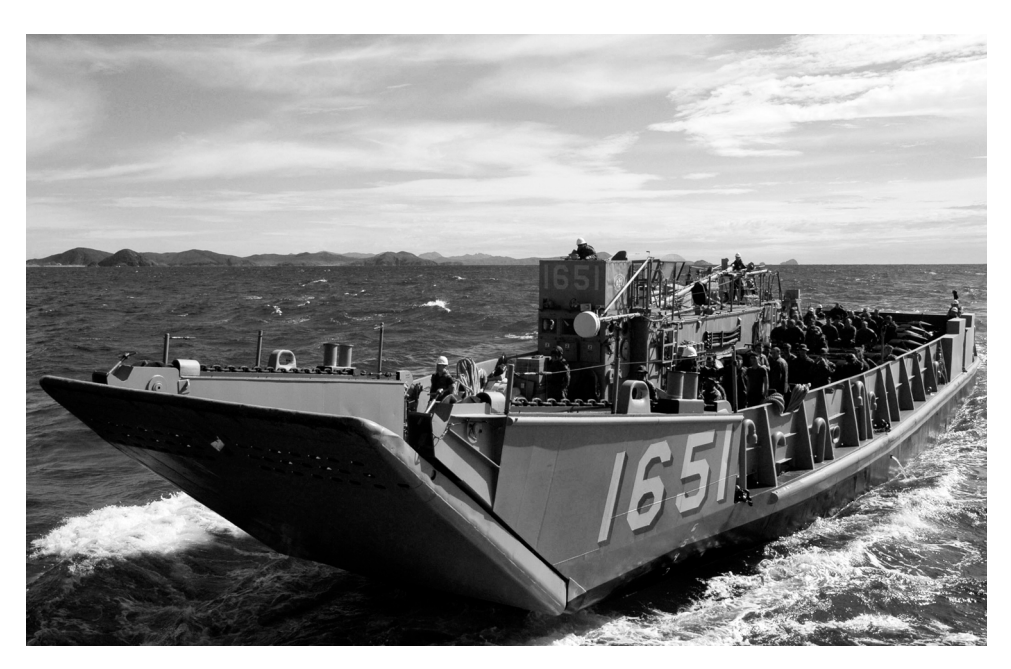
Figure L-9. Landing Craft, Utility.