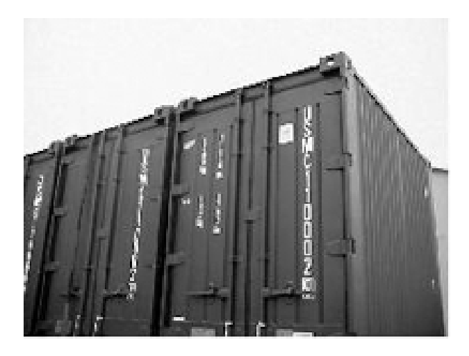
Figure 4-2. QUADCON Markings.

Each end of the TEU/ISO container or QUADCON is marked in the upper right corner of the right door with the ISO registry number (see fig. 4-2). This number is in 4-inch letters/ numbers and has a "USMC" prefix. The ISO registry number, typically located on the left door, consists of 2-inch letter markings that reflect the maximum gross, tare (empty), and net weights of the container in kilograms and pounds.