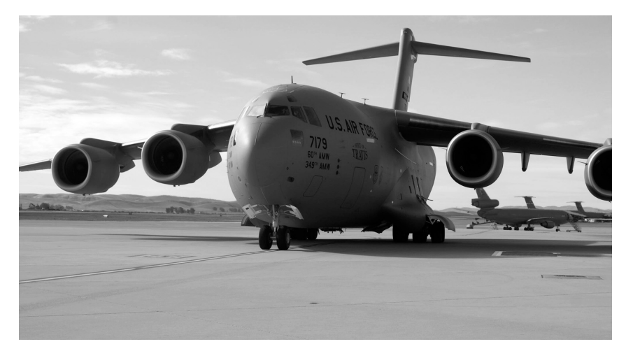
Figure 8-1. C-17 Globemaster III.

It is important that timely, accurate data be developed, validated, and provided to HHQs. Such data forecast the quantities of personnel, supplies,