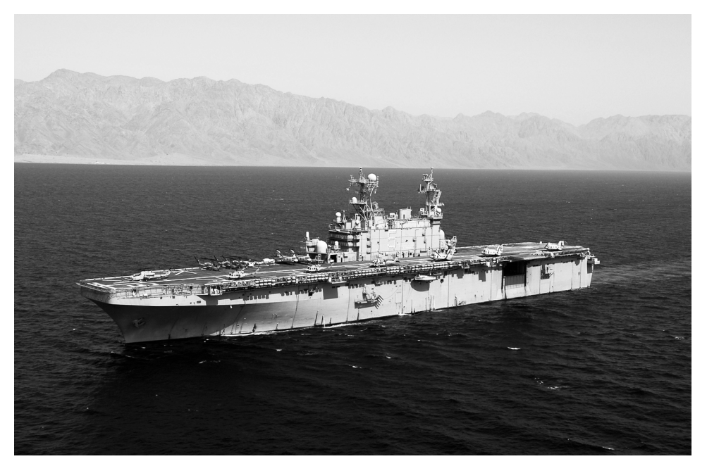
Figure L-2. USS Peleliu (LHA-5).

The landing craft numbers listed in table L-8 are the maximum number of each type of craft that can be stowed in the well deck exclusive of any other craft. Combinations of these craft may be stowed in the well deck if necessary.