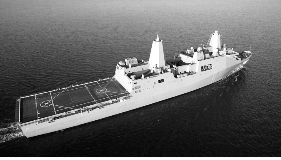
Figure L-5. USS San Antonio (LPD-17).

The landing craft numbers listed below are the maximum number of each type of craft that can be stowed in the well deck exclusive of any other craft.