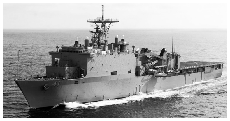
Figure L-6. USS Whidbey Island (LSD-41).

ships provide greater storage space for weapons and equipment, improved facilities for embarked troops, greater range of operations, and the capability to embark either conventional landing craft or LCACs. The ships incorporate MHE, including elevators, package/roller conveyors and forklifts, pallet transporters, and a turntable. The turntable is located between the well deck and the helicopter deck to assist in the rapid turnaround of vehicles and equipment during loading/ offloading operations.