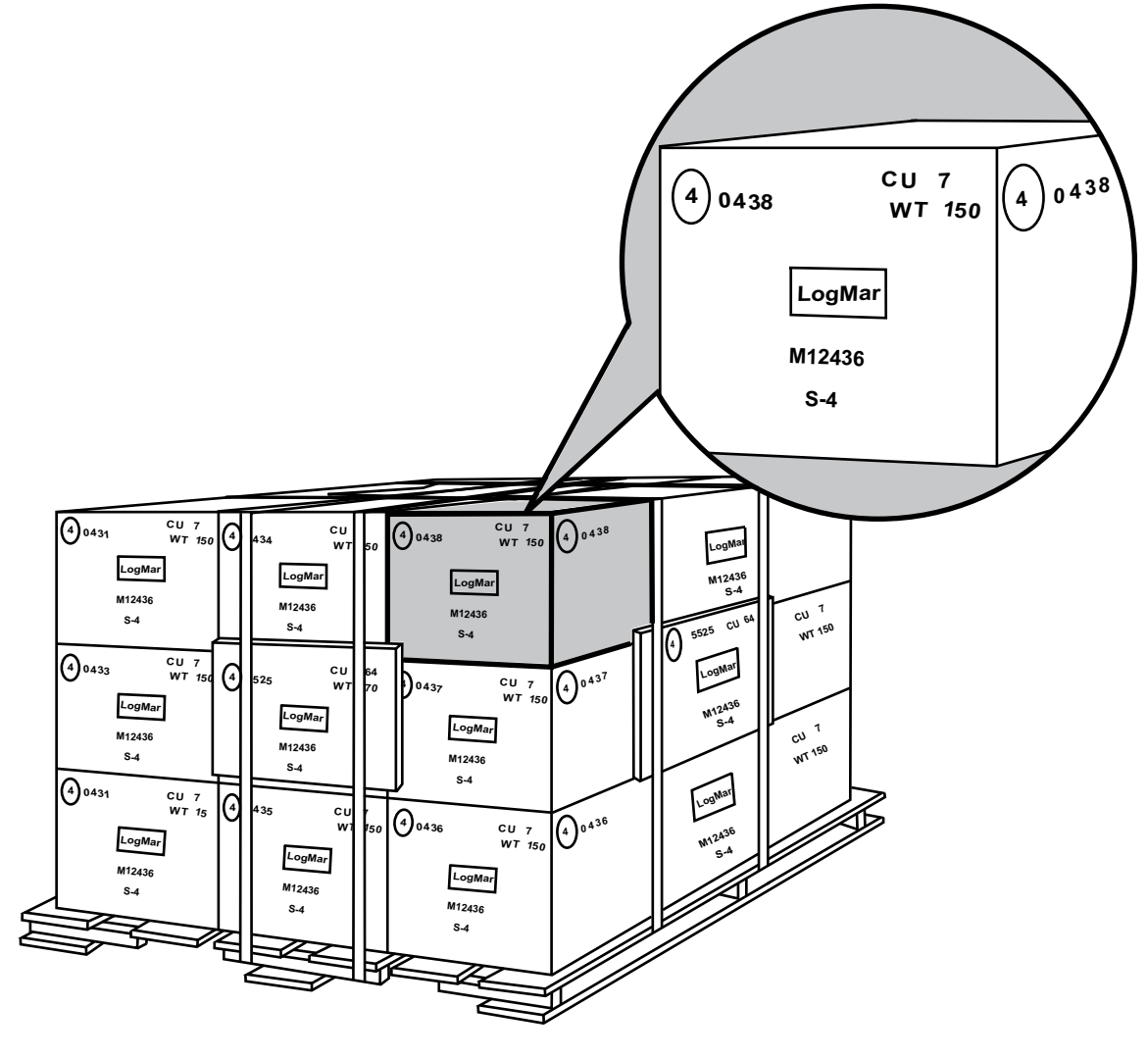
Figure 4-4. Warehouse Pallet Load.