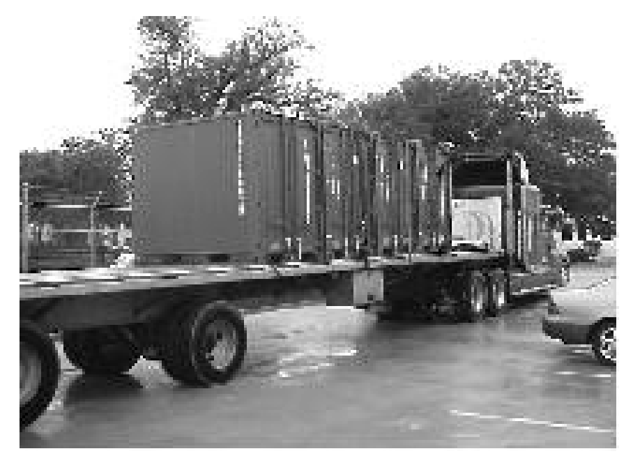
Figure 6-2. Flatbed Trailer with Quadruple Containers.

The bi-level car is normally used to transport HMMWV variants. It is designed to hold ten vehicles (five on the top deck and five on the lower deck) with a height restriction of 76 inches on the lower deck. Top deck height restrictions are based on overpass clearance requirements peculiar to the route between the departure and arrival railhead.