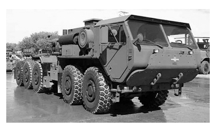
Figure 6-1. Logistics Vehicle System Replacement.

The Marine Corps has a wide range of tactical vehicles used during day-to-day operations to satisfy units' external overland transportation requirements. The MLGs have the bulk of these assets to support the resident MEF. These vehicles range from high mobility multipurpose wheeled vehicles (HMMWVs) to the heavy-lift logistics vehicle system replacement (see fig. 6-1). Marine Corps TM 11240-15/4C, Motor Transport Technical Characteristics Manual , lists fielded motor transport assets.