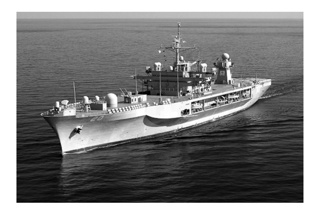
Figure L-1. USS Mount Whitney (LCC-20).

The Blue Ridge class LCC is not capable of storing/transporting LFORM. Tables L-1, L-2, and L-3 provide specific information about this class of ships.